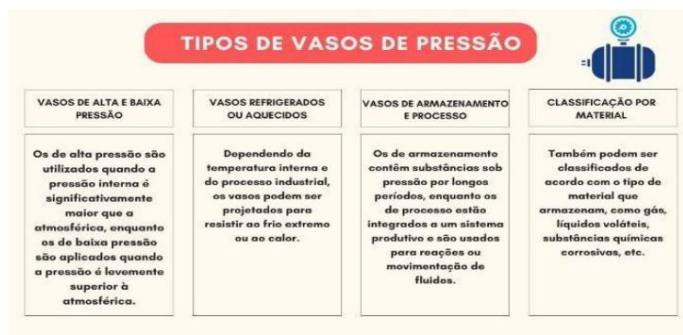
Figure 1: Types of pressure vessels