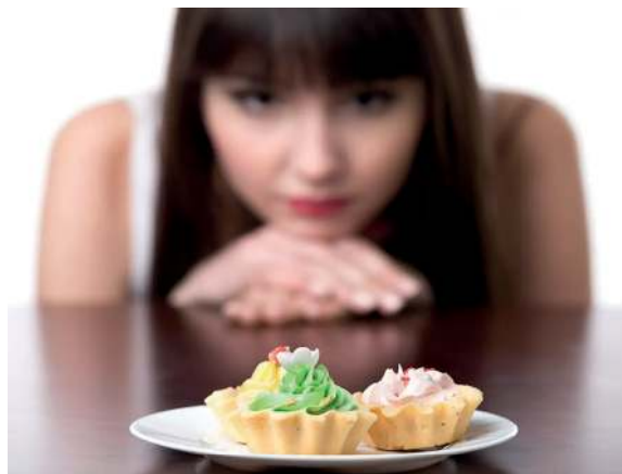
Figure 4: Anxiety

Exaggerated consumption of high-calorie foods (sweets, chocolates, snacks, soft drinks, alcoholic drinks, etc.) may be associated with high levels of anxiety and stress, which can increase the chances of inflammatory processes and impact the central nervous system and/or trigger mental health problems such as depression (Guerra, 2022).