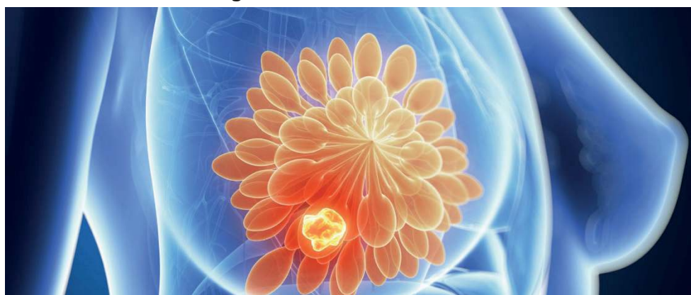
Figure 3: Breast cancer

Obesity is already considered an epidemic and can cause several types of cancer, among which breast cancer is one of the most difficult to treat due to the negative effects of being overweight. There is a close relationship between obesity and breast cancer, as adipose tissue (generally inflammatory) produces hormones that, in excess, contribute to the development of the disease, especially in obese, sedentary and menopausal women. Practicing regular physical exercise and maintaining weight with adequate nutrition are essential for reducing the risk of the disease (Rauen, 2021).