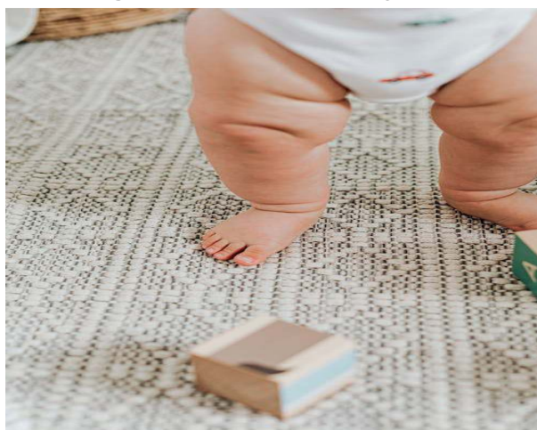
Figure 1: Childhood obesity

Research carried out by Peninsula Medical School in England, revealed that the inadequate behavior and eating habits of parents can be a determining factor in their children's obesity, which can lead to diabetes, cardiovascular diseases, cancer, as well as premature death in adulthood. It is up to parents to raise awareness, seek support from specialized professionals to reproduce healthy eating habits in their children and encourage them to practice regular exercise (Rauen, 2021).