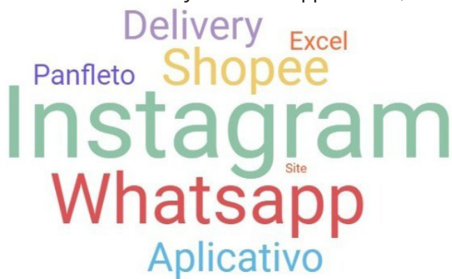
Figure 9 - Cloud of most repeated words about media and management knowledge

Regarding management knowledge, all of them sought information in online courses and videos accessed on YouTube. In terms of means of communication used, the business owners highlighted Instagram as the main vehicle for promoting services and communicating with their customers. They mention use of some delivery and sales applications, however, the main network and most used is Instagram.