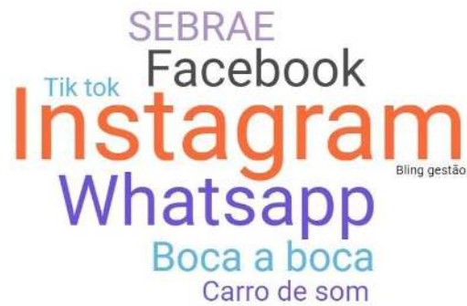
Figure 8 - Cloud of most repeated words about media and management knowledge

Finally, regarding the formalization of commerce in the MEI, formalization of a self-employed professional, a professional who carries out his/her activities without an employment relationship (SEBRAE), from the opening of a company, all were registered and receive the benefits, highlighting these as the main advantages of being a MEI and not mentioning any disadvantages, with the exception of one entrepreneur who does not recognize many advantages in this type of business category: