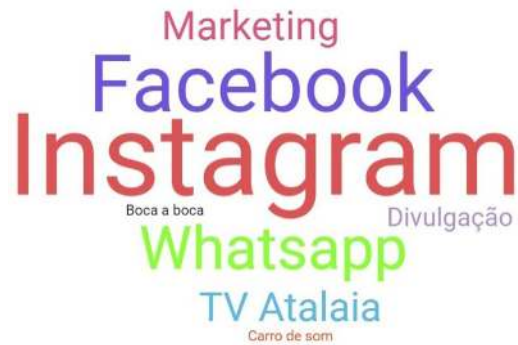
Figure 6 - Word cloud of High Experience respondents extracted from Infogram

When asked about management applications that facilitate professional planning and organization, the three interviewees have a tool, a form or an application to manage the business. Among them are Excel software, Google Calendar and the Witsel application.