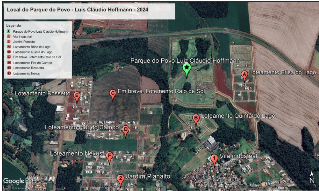
Figure 1. Location of the Luiz Cláudio Hoffmann People's Park.