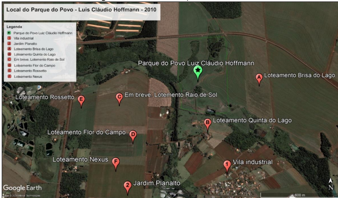
Figure 3. Location of Parque do Povo in 2010