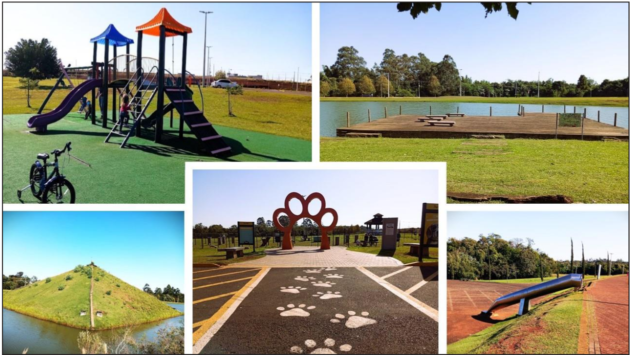
Figure 2. People's Park Equipment