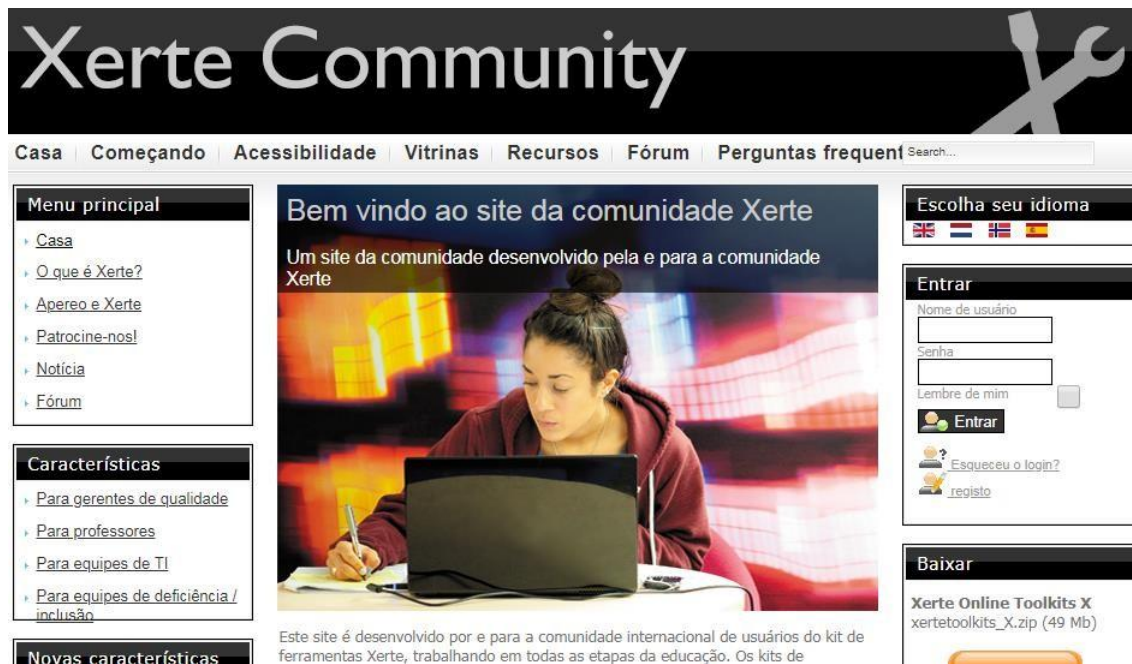
Figure 1: Xerte platform available at: https://www.xerte.org.uk/index.php?lang=en . Accessed on: 12/10/2018