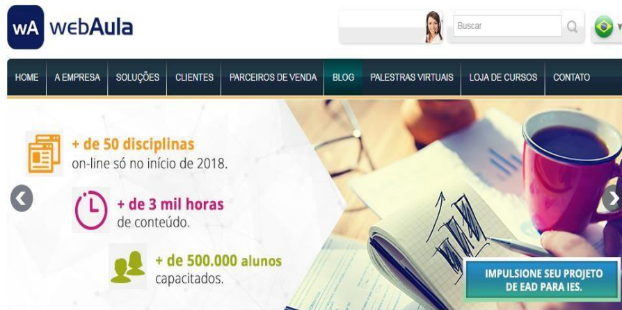
Figure 2 WebAula available at: http://www.webaula.com.br/index.php/pt/ . Accessed on: 12/8/2018