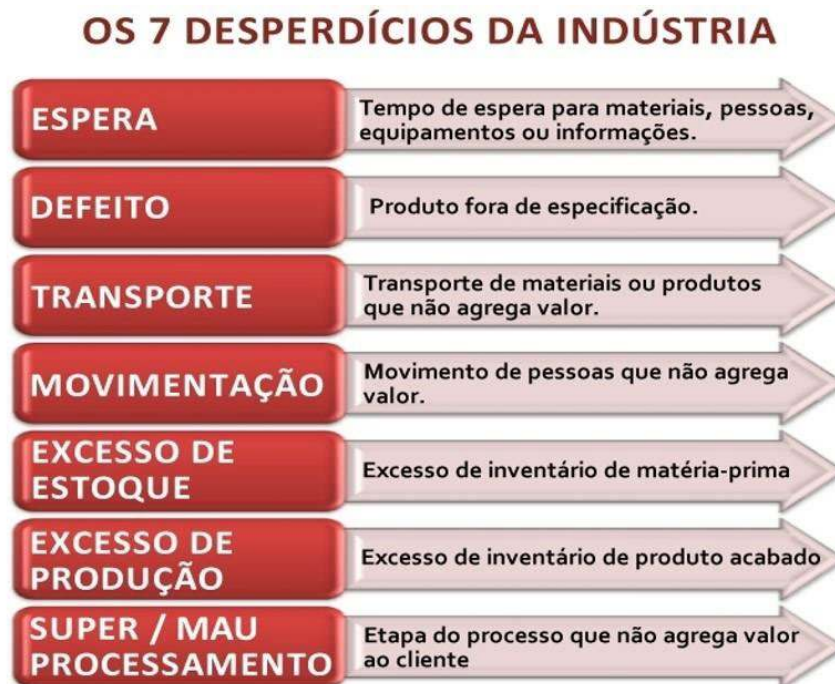
Figure 1: Seven wastes present in Lean Manufacturing

each company will be better utilized. The following figure mentions the seven wastes represented by OHNO (1997).