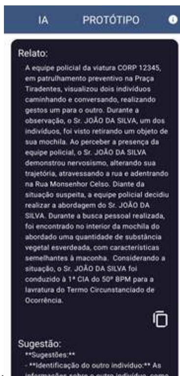
Figure 3. Final result after inserting the text and selecting “Transcribe”.