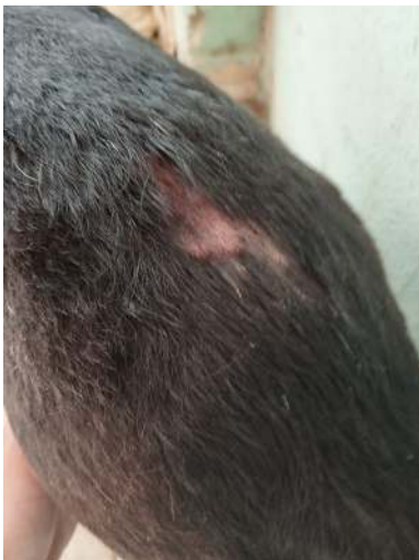
Figure 4 Excoriation

When reviewing the patient's clinical history, the owner reported having difficulty combating ectoparasites in the area (which had low vegetation) and that she had four other dogs in the house, but only the one treated had alopecia (the other animals had pruritus).