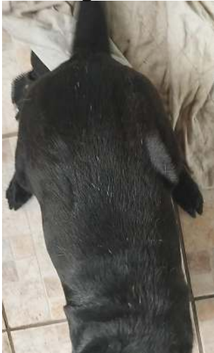
Figure 5 Full recovery of lesions and itching

Approximately 4 weeks after treatment with the anti-inflammatory and placement of the collar, the infestation by ectoparasites was declared under control. The animal experienced partial hair growth on the skin lesions (Figure 5), showing the effectiveness of the treatment instituted by the veterinarian.