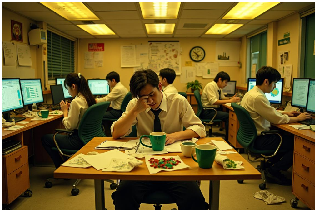
Figure 7. Inadequate administrative environment (authorial)

Occupational health is a domain of public health that analyzes and acts on the prevention and occurrence of work-related diseases and accidents (SCHULTE, CHUN, 2022). Occupational health designates actions in favor of the health and well-being of workers in the form of safe and healthy work environments. Well-being at work is a broad concept, which can encompass a number of components of the worker's life, such as physical and psychological health, job satisfaction, work-life balance and the quality of interpersonal relationships, figure 7 (WARR, 2007).