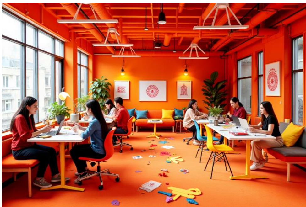
Figure 4. Creative environment with excessive colors (authorial)

In environments where creativity and innovation are essential, such as advertising agencies and design studios, vibrant and stimulating colors can be beneficial. Colors such as yellow, orange and green increase energy, motivation and creativity (LEE, PARK, KIM, 2021). It is important to avoid overstimulation, which can lead to distraction and fatigue. By combining vibrant colors with neutral tones, it is possible to create a balanced and inspiring environment, figure 4.