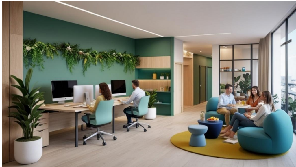
Figure 5. Administrative environment (authorial)

In production environments, where safety and efficiency are crucial, color can be used to signal danger areas, identify equipment and guide workers, figure 6 (HASHEMI et al., 2023).