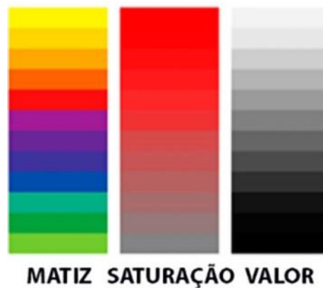
Figure 3 – Color characteristics (MCDONALD, 1997).

Color can be verbally expressed by three fundamental characteristics: hue , saturation and value .