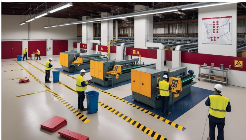
Figure 6. Production environment (authorial)

In production environments, where safety and efficiency are crucial, color can be used to signal danger areas, identify equipment and guide workers, figure 6 (HASHEMI et al., 2023).